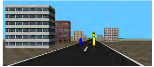
Figure 1: A screenshot of the ConTRe . The driver controls the movements of the blue cylinder while the yellow cylinder moves autonomously.

The ConTRe Task introduced in this paper was created to overcome some of the limitations of the aforementioned approaches. As such, it should be sufficiently controlled to eliminate major subject failures, like going in circles or colliding with objects by mistake, which would interfere with the automatic performance evaluation. Track length and duration should moreover be adjustable according to secondary task demands. Another intended advantage of the ConTRe